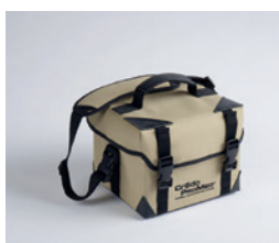
2 LITRES PAYLOAD