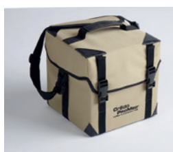
4 LITRES PAYLOAD