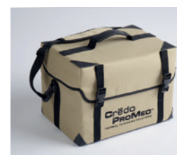
8 LITRES PAYLOAD